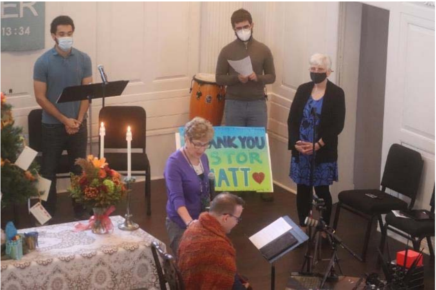
Pastor Appreciation Sunday, October 11 th , 2020