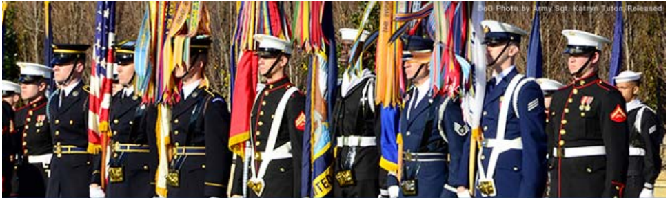
VETERANS DAY | NOVEMBER 11

Veterans Day is a time for us to pay our respects to those who have served our country. For one day, we stand united in respect for all our veterans.