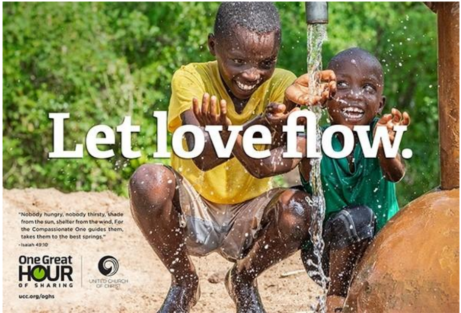
"One Great Hour of Sharing" by the United Church of Christ