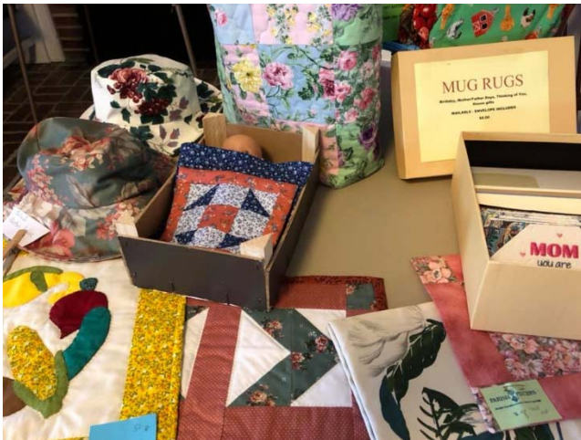
Handcrafted Parish Piecers quilted gifts displayed for sale.